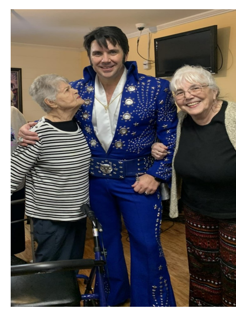
Several of our residents had a dream to "See the King of Rock and Roll!"