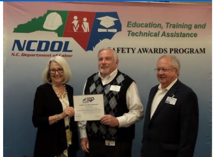
Cross Road Retirement Community received a Gold Safety Award from the NC Department of Labor. We were also recertified for the SHARP Safety award again this year!