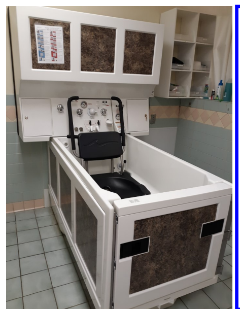
There are two new features in our Memory Care...

We now have a new state-of-the-art whirlpool tub to make bathing our residents easier.